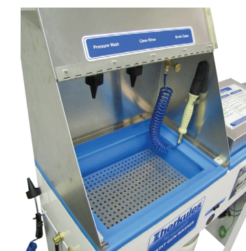
G520 manual cleaning tank