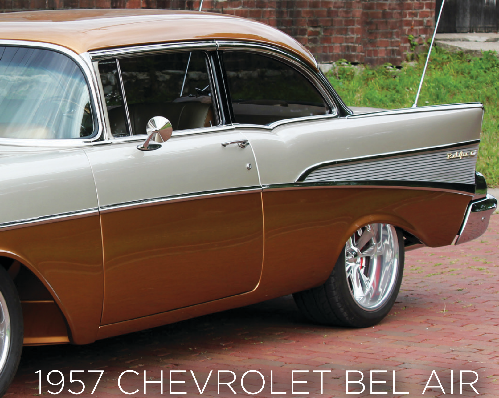
1957 CHEVROLET BEL AIR