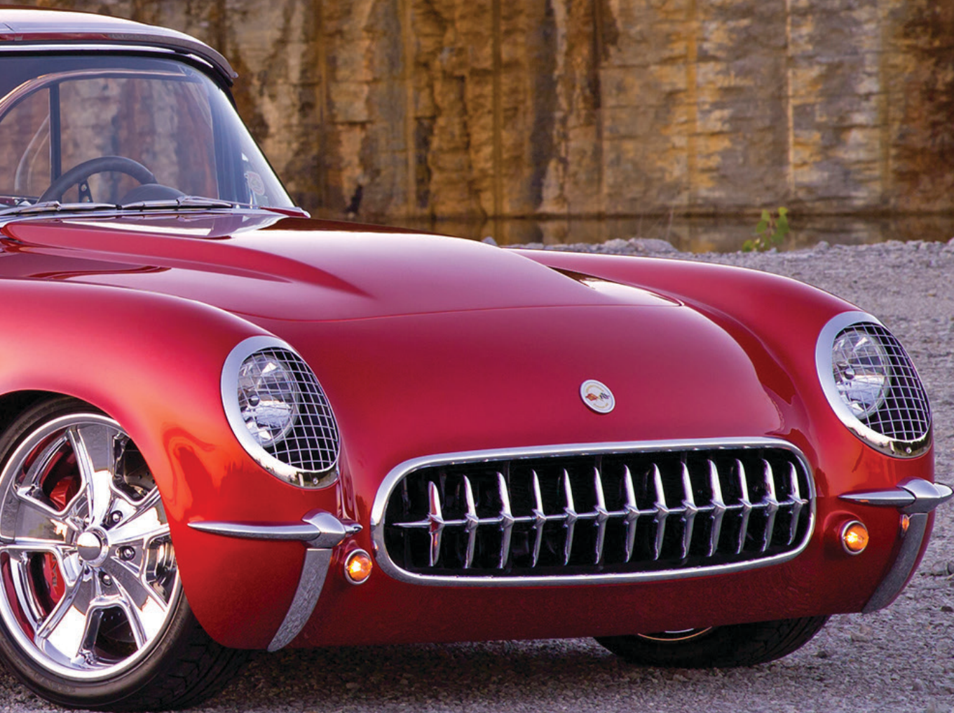
1954 CHEVROLET CORVETTE