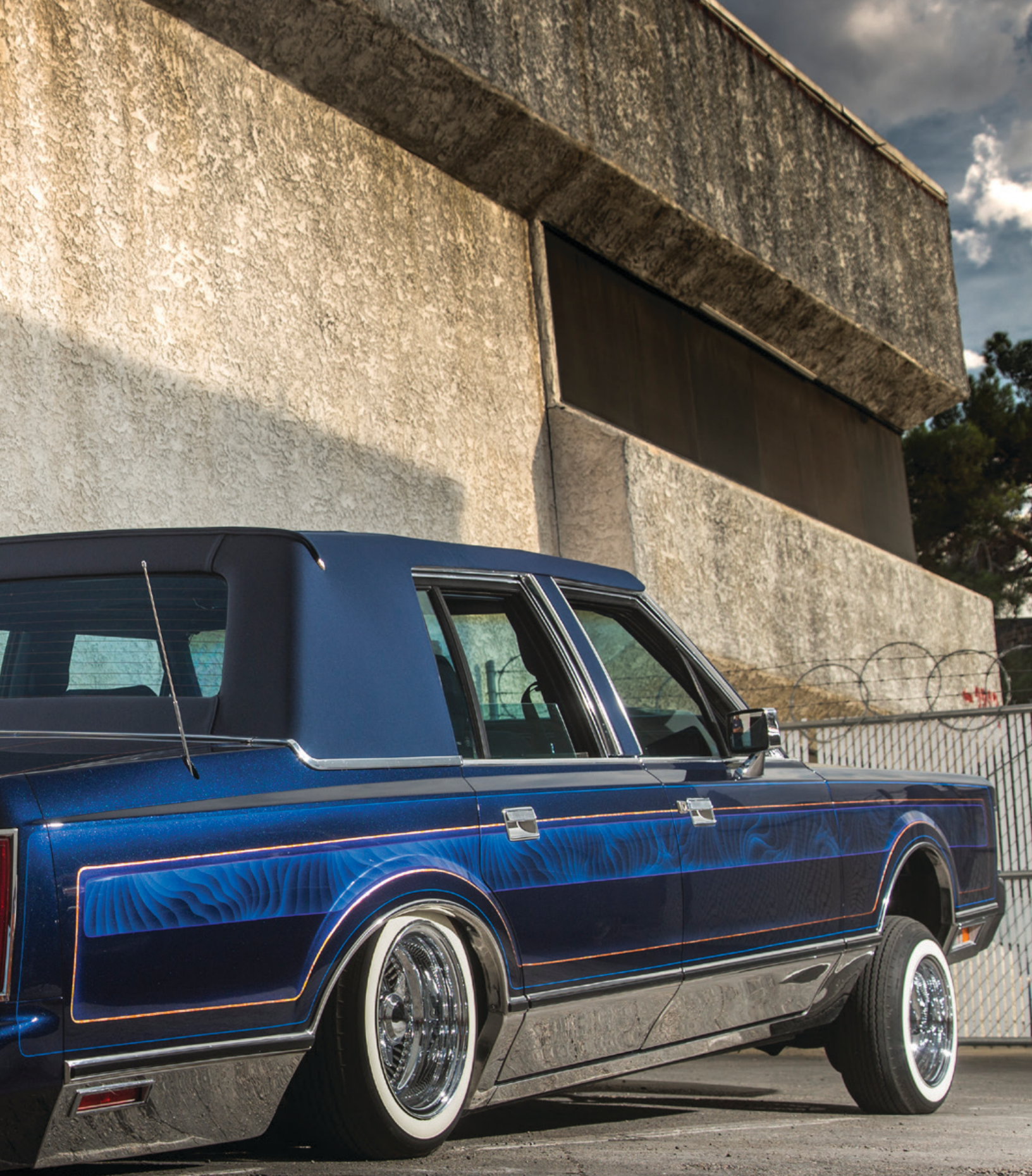
1986 LINCOLN TOWN CAR