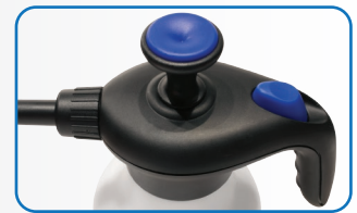
Completely enclosed to protect mechanisms from dust & dirt