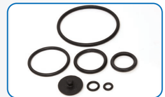
Pump sprayer gasket kit (Sold separately: #4002EPDM)