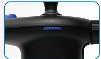
Built-in pressure relief valve